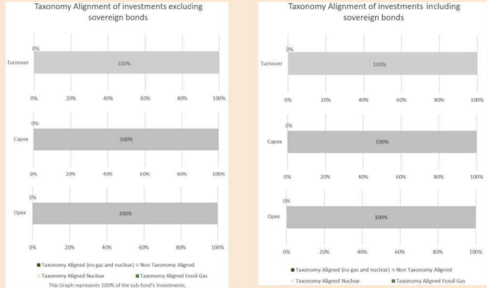
*For the purpose of these graphs, 'sovereign bonds' consist of all sovereign exposures

The graphs below show in green the percentage of investments that were aligned with the EU Taxonomy. As there is no appropriate methodology to determine the taxonomy-alignment of sovereign bonds*, the first graph shows the Taxonomy alignment in relation to all the investments of the financial product including sovereign bonds, while the second graph shows the Taxonomy alignment only in relation to the investments of the financial product other than sovereign bonds.